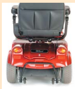
Modern styling and looks