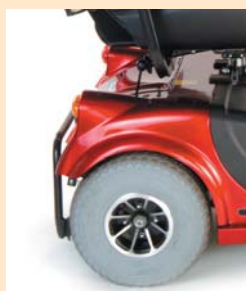
Fully adjustable suspension for additional comfort