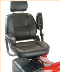
Fully adjustable backrest for comfort