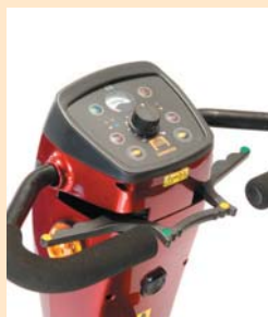
Dual drive for finger & thumb control